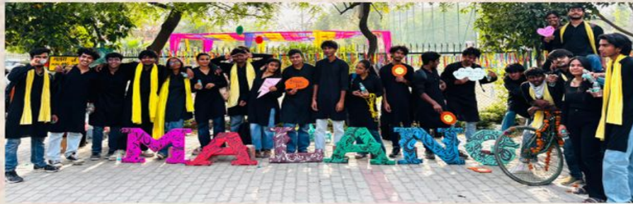
BEST MUSIC - NATUVE