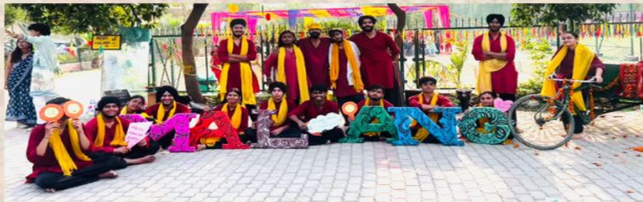
BEST THEME - ET-CETERA