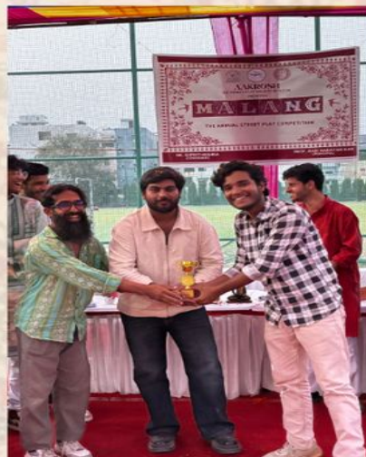
BEST ACTOR -KARTIK VAYAM